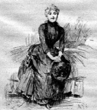
"SHE LAUGHED TILL THE TEARS STREAMED FROM HER EYES."

"What is it that would never do, Janet?" said the Vicar's calm voice over the hedge. Fortunately he did not see the pair for a moment