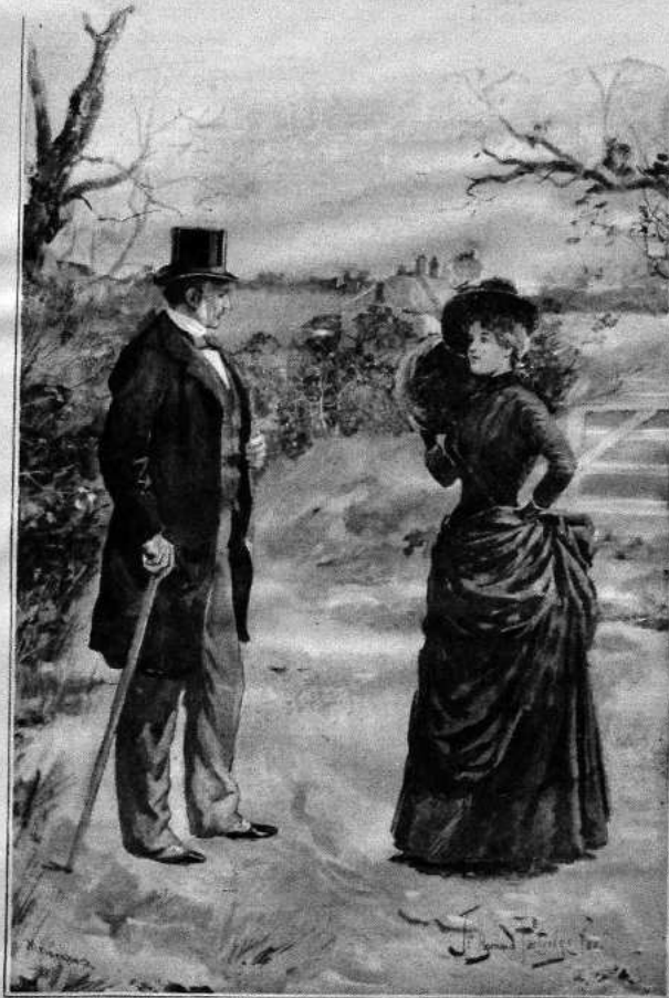
"JANET, STANDING OPPOSITE TO HIM, AMAZED, HAD AN ALMOST CONVULSIVE IMPULSE TO BURST INTO A LAUGH."

"But suppose," said Mrs. Bland, "which is far more likely, that