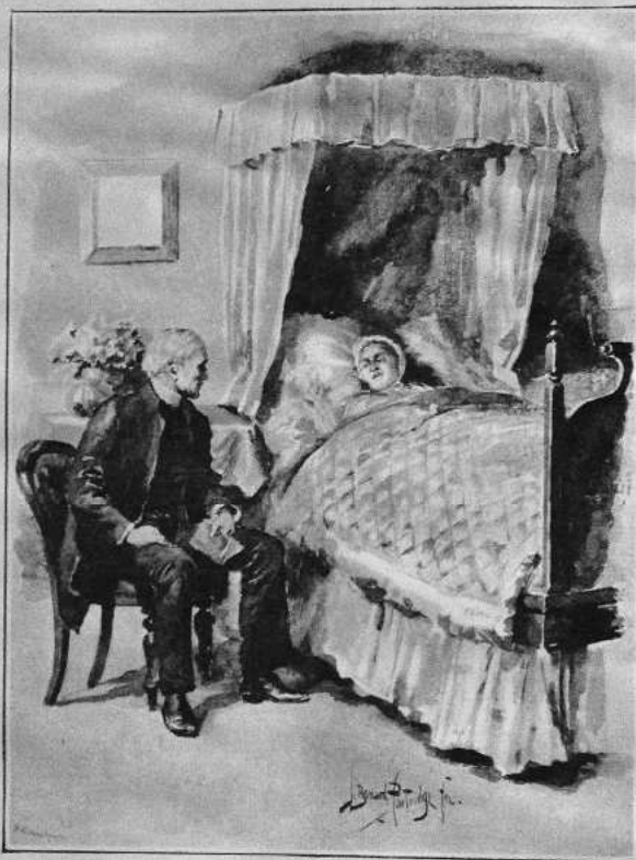
"HOW ARE YOU?" HE SAID. "NOT ANY BETTER; BUT, AT LEAST, NOT ANY WORSE."

This gain, however, to the patient was balanced by a certain harm to Janet's moral nature which arose from her silent conviction that she counted for very little in the depression or in the renewed courage of her benefactress. The girl had been carried away for the moment, when she had entreated her aunt not to think of her, by an impulse of generosity, and by all the suggestions made around her as to the anxiety poor Miss Philipson must feel in leaving her little companion unprovided for. Janet had for a moment believed that it must be so. But she was very clear-sighted, as young observers so often are, especially in anything that concerns themselves, even our own children finding us out silently in many self-deceptions not always suspected by ourselves; and she very soon discovered that she had made a mistake, and that anxiety for her had very little share in the weight that was upon Miss Philipson's mind. The result of this upon Janet was not so much any reproach to Miss